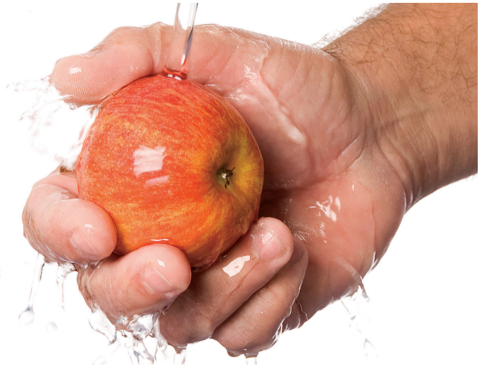
CONCENTRATION OF SANITIZERS REQUIRED for >5 log reduction of E.coli O157:H7 in 60 seconds