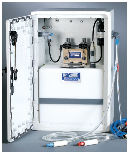
Wall Mount Activation System™