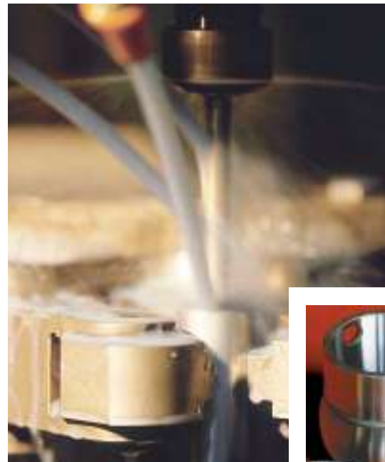
Above: Biostable coolant flooding machining application