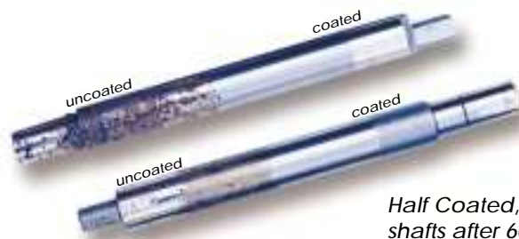
Half Coated, half uncoated shafts after 60 days — Singleton Humidity Cabinet Test