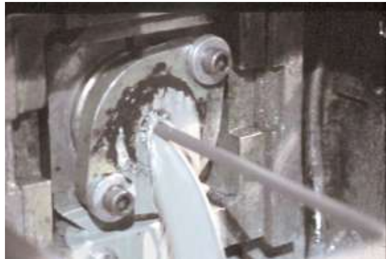
Above: High speed cold drawing application of steel bar