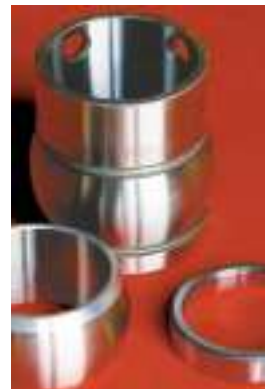
Right: Bearing components ground with a Perkool