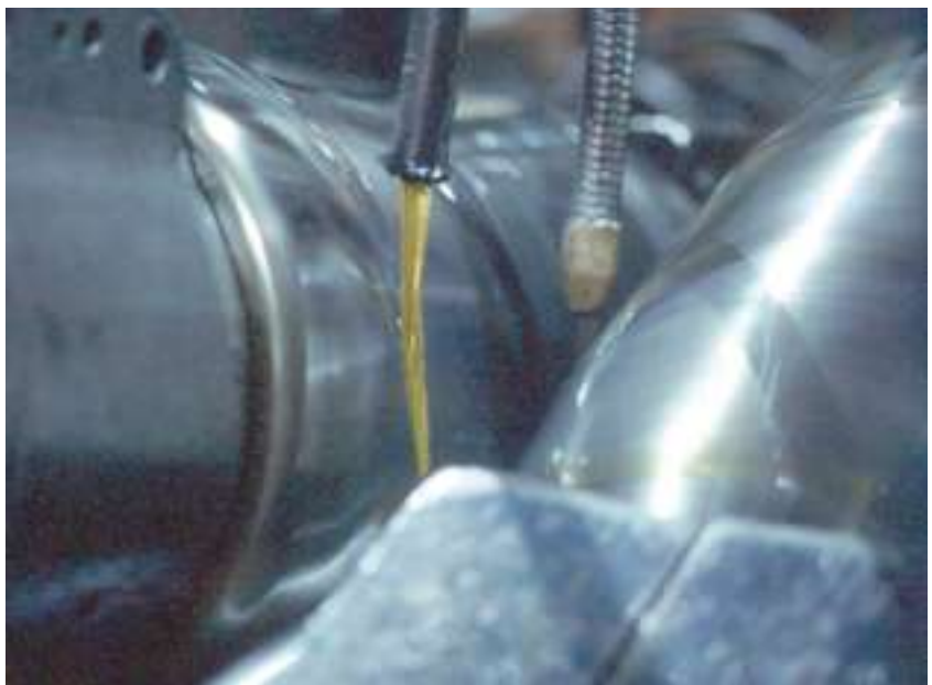
Right: Perkote being applied to straightening and polishing rolls