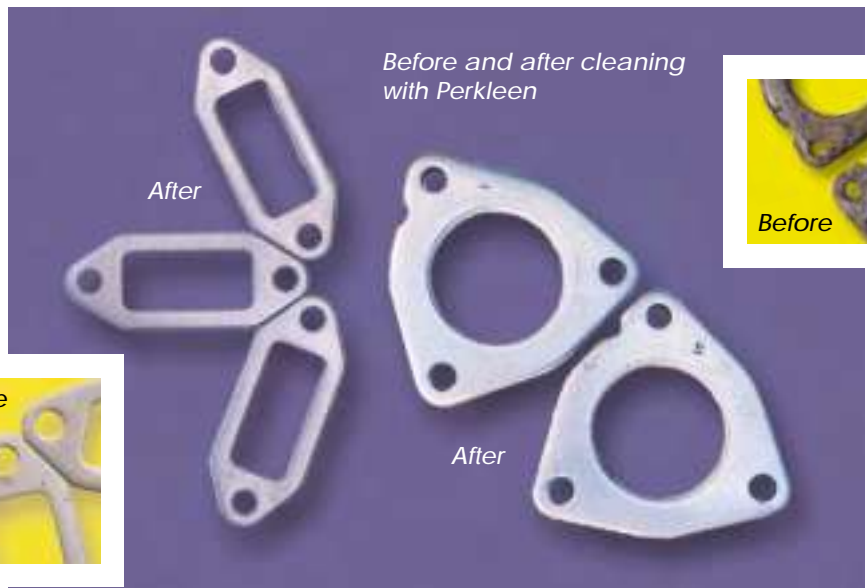
Before and after cleaning with Perkleen