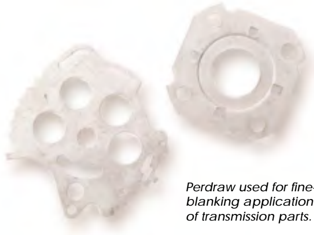
Perdraw used for fine-blanking application of transmission parts.