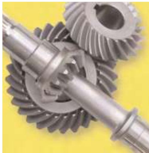
Above: Gears produced using Perkut