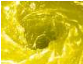
Above: Mixing a batch of Perlube AW68