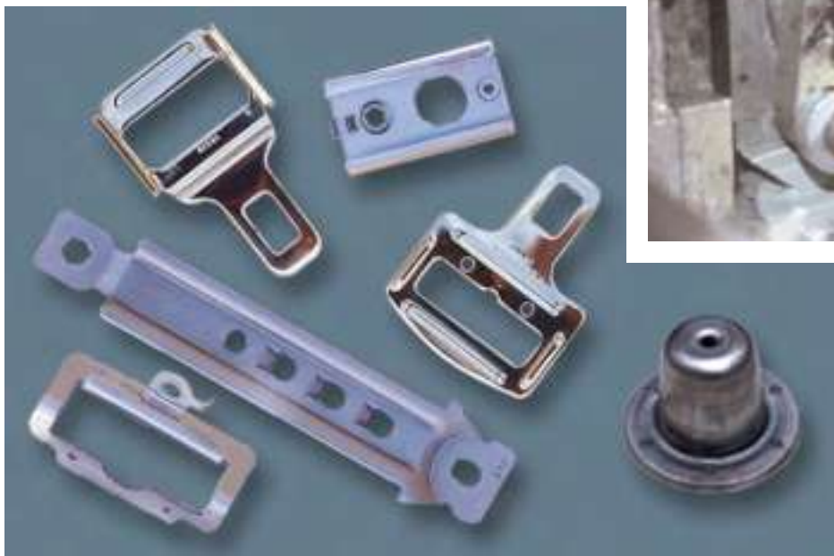
Left: Various electronic boards, transmission parts, brackets, and cups formed by balancing, stamping, or drawing