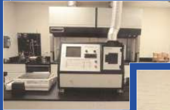
Phalex Lubricity Tester and Lab with microscope