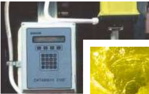
Above: Mass flow meter used for drum filling with accuracy of 1/10 of a percent