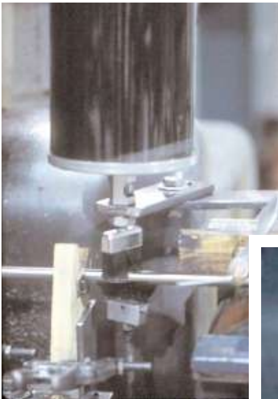
Above: Perkote, as a rust inhibitor applied to centerless ground bar

Many of the Perkotes meet military specifications and satisfy salt spray and humidity cabinet requirements.