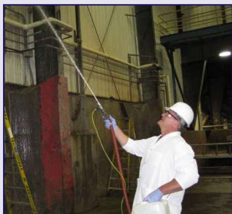
Labor Saving Application Techniques High reaching equipment solutions to get the product where you want it.

Render-SBG (Surface Bonding Gel) is a heavy duty, liquid alkaline cleaner for cleaning a wide variety of tough soils. When diluted with water in the recommended range, a thin gel is created. This solution bonds to soils and clings to surfaces, increasing contact time over typical cleaners. This extended contact time allows Render-SBG to penetrate and react with the soils, allowing more complete soil removal. Once flushed from surfaces to